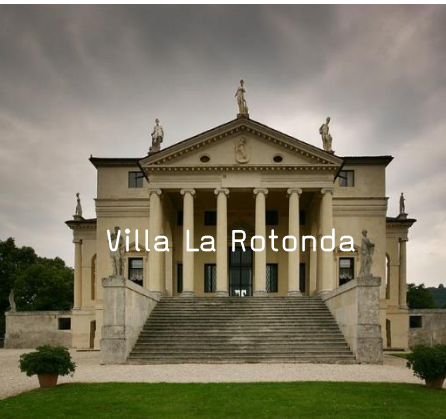
Villa La Rotonda