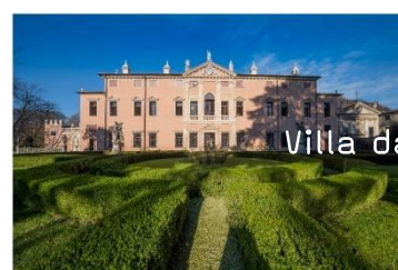
Villa da S. Sofia